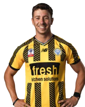
11. A. TURE