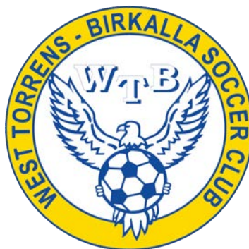
7. A. MAZZUCOTELLI